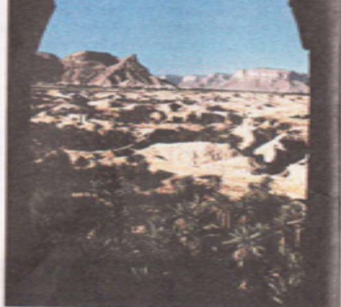
Unbeaten track .... (clockwise from top left) hiking through

Who goes? Intrepid Travel has a 13-day trip to Bangladesh. Canoe the mangroves, marvel at mosques, sail the Shitalakshya River, shop at the Shankharia Bazaar and visit tea plantations and waterfalls. From $1150, see intrepidtravel.com.au .